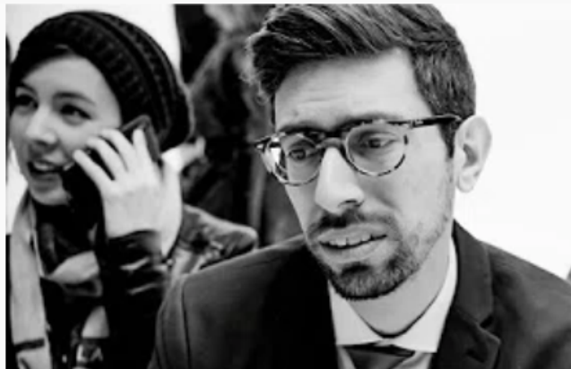
LIFE IS FINE / 315K VIEWS

Distributed through Orchard, FACTOR supported