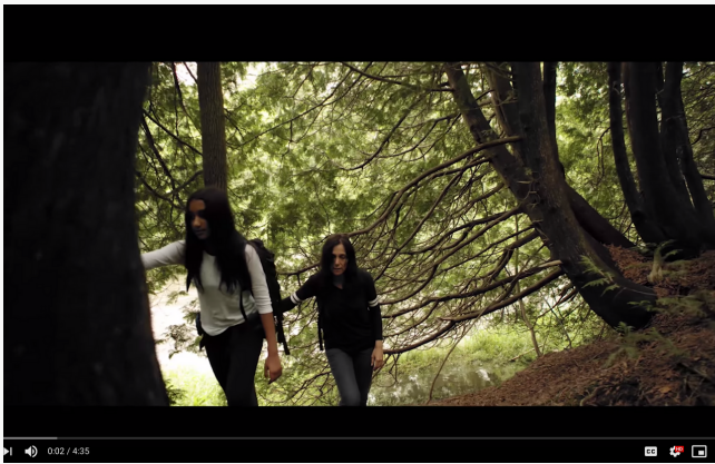
FIRST / 50K VIEWS

From Toronto Arts Council supported album, "Weekender".