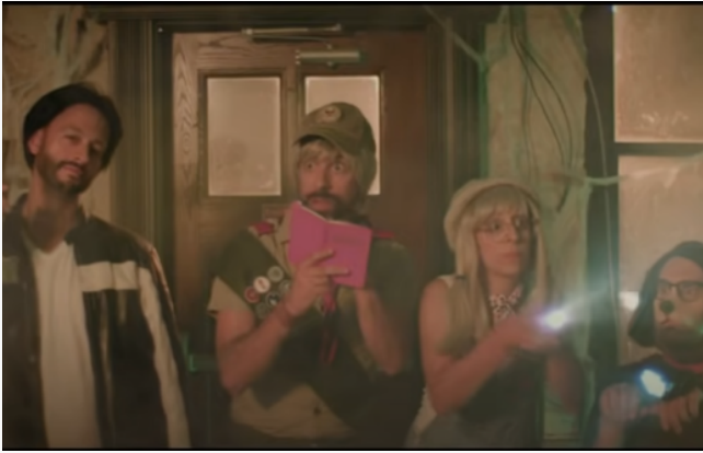
FALL APART / 25K VIEWS

From Toronto Arts Council supported album, "Weekender".